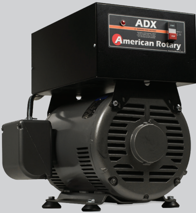
Figure 2: Idler/Floor Mount

480V option is available for locations that have incoming 480V single phase power to produce 480V three phase power.