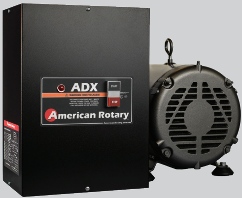
Figure 1: Wall Mount

Figure 1 shows the standard mounting style for Rotary Converters. (AR, AD, ADX, AUL)